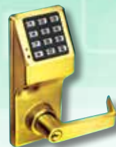
Lever set in US3 DL2700/3