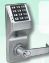
With IC Core in 26D DL2700IC/26D