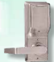
Secure battery compartment on inside door