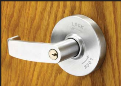
Arrows show direction to turn the key on bored locks (Classroom Security Intruder function)