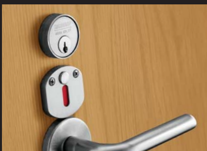
Red indicator clearly displays locked/unlocked on mortise locks (Classroom Security Intruder function)

School administrators and facility managers have a new primary responsibility: making sure their learning environment is safe and secure. The need to keep unauthorized individuals out without inhibiting the daily freedom of movement of students and staff is of the highest priority. There are several schools of thought on how locking solutions can help accomplish this.